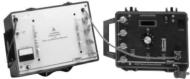
Low-Range/High-Current Model Cat. No. 247101 consists of a Single-Pak DLRO, Cat. No. 247001-3, and separate 100 ampere test current supply, Cat. No. 247120. The 100 ampere supply also may be ordered as an option.